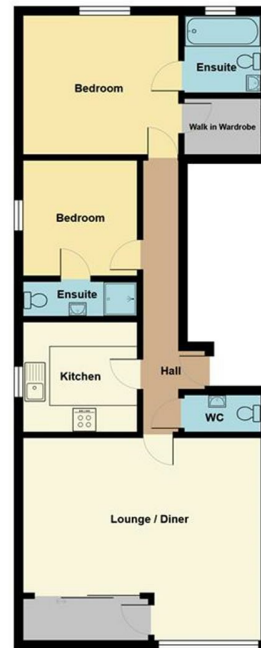
4, Mercer House, Fairlawn Road, Lytham St Annes, FY8 5QP

plumbing and electrical installations. All purchasers are recommended to carry out their own investigations before contract. Details Prepared August 2025